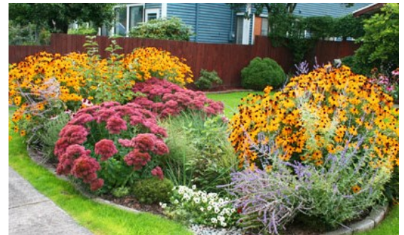
RAIN GARDENS ARE A GREAT ADDITION TO YOUR YARD!

We often think of agriculture, industries and big business when it comes to water pollution, but individuals contribute heavily to water pollution. We supply eroded soil, oil, pesticides, fertilizer, pet waste, trash and other contaminants, and rainwater carries them "away." While each individual's contributions to pollution may seem very small, the cumulative effect is significant. The weather is not the enemy; rather, it is our changes to the landscape that have negative impacts. Rain that falls on land dominated by fields and forests trickles into the soil to recharge groundwater or drains slowly into rivers. In contrast, in heavily populated areas with lots of hardened surfaces such as streets, parking lots, sidewalks, roof-tops, and driveways, this rainfall cannot seep into the ground and instead flows through pipes, ditches, or other channels directly into streams and other waters we use for swimming, fishing, and drinking. Rainfall that doesn't soak into the ground is called stormwater runoff. You can help! Here are some simple tips: Leave grass higher & mow more frequently to retain more water; Leave clippings on lawn to keep it fertile and moist. Grass clippings are 75 to 85 percent water and rich in nitrogen; and Create raised planting beds at the lowest point of your lot, around patios/decks and near downspouts, keep them mulched to intercept and store rainfall.